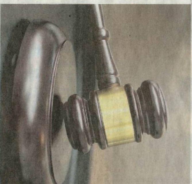
The properties which were used as brothels were located in Kildare town, Ballyconnell in Co Cavan, Enniscorthy in Co Wexford, Ballymahon in Co Longford, Ballaghaderreen in Co Roscommon, Carrick on Shannon in Co Leitrim, and Tullow, Co Carlow. FILE PHOTO